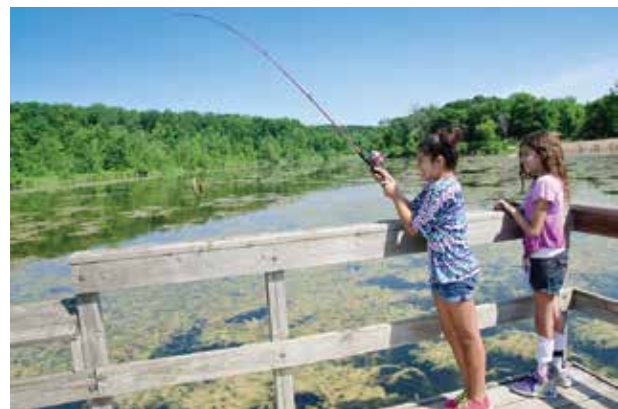
Photos: Minnesota Department of Natural Resources, unless otherwise noted. Persons with disabilities may request this information in an alternative format.

The DNR Information Center The DNR's Information Center is available to provide free publications of facilities and services as well as answers questions pertaining to DNR recreational opportunities in Minnesota. 500 Lafayette Road, St. Paul, MN 55155-4040 651-296-6157 (local) or 1-888-MINNDNR mndnr.gov